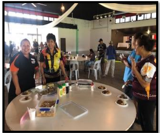
Enjoying our local cooked bush foods