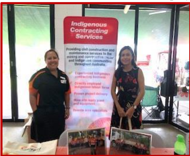
Intract- Indigenous Contracting Services