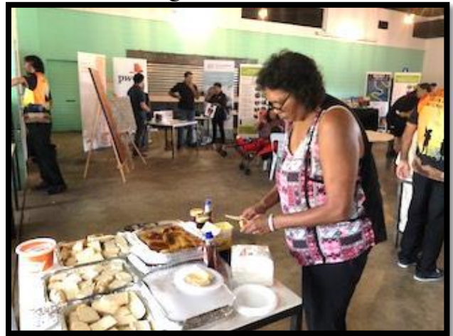
local cooked Dampers & jams