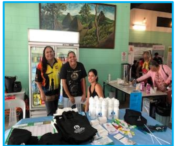
Organisation promotional items