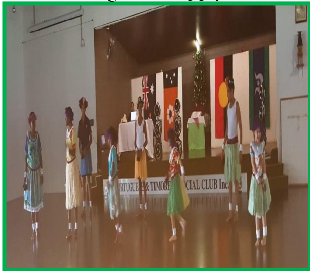
Young Torres Strait Islander dancers